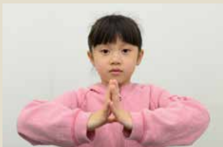
Stretch fingers backward