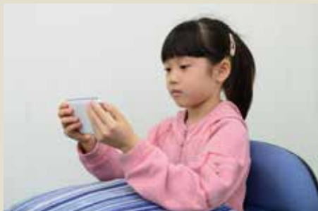
Keep back and neck straight with elbow supported