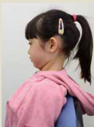
Tuck chin in