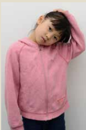
Stretch neck sideways