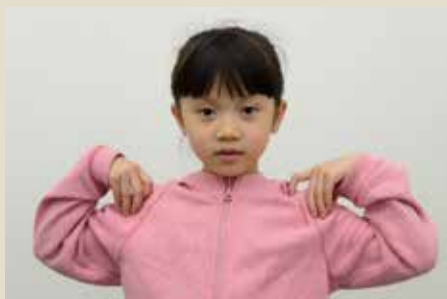
Circle shoulder blade backward