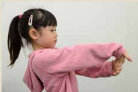
Keep palm up and stretch wrist downward