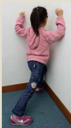
Stretch chest wall